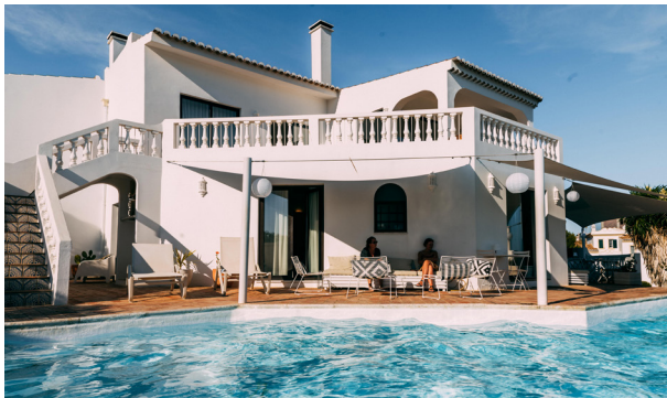
ONE LIFE LODGE