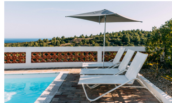
ONE LIFE LODGE